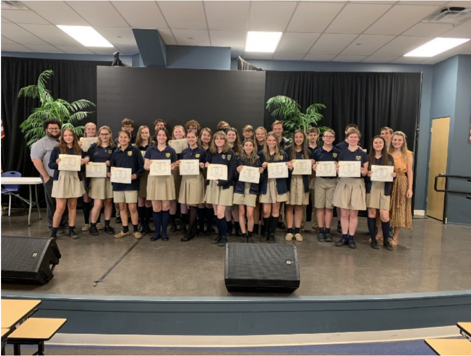
The National Latin Honors Society Induction was held on April 21st.